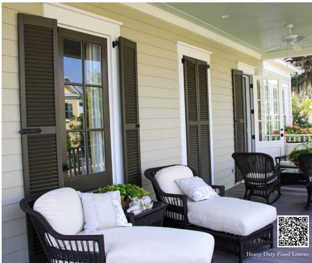
Heavy Duty Fixed Louver