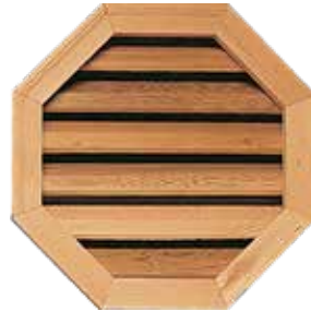
Cedar Ventilator Octagonal with Octagonal Back