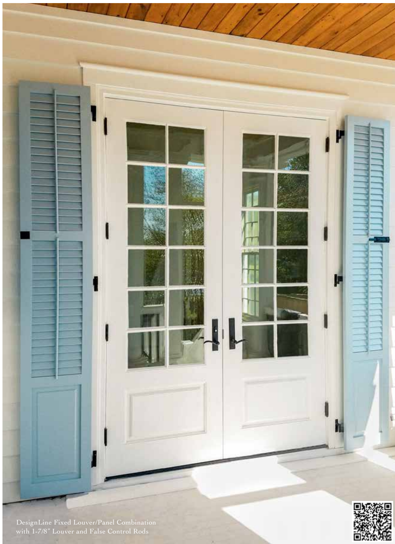
DesignLine Fixed Louver/Panel Combination with 1-7/8" Louver and False Control Rods