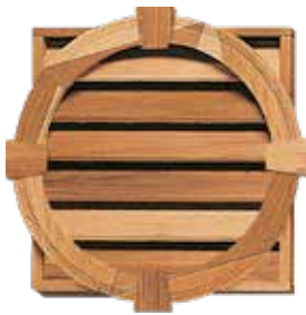
Cedar Ventilator Keystone Square Back Flat Mould