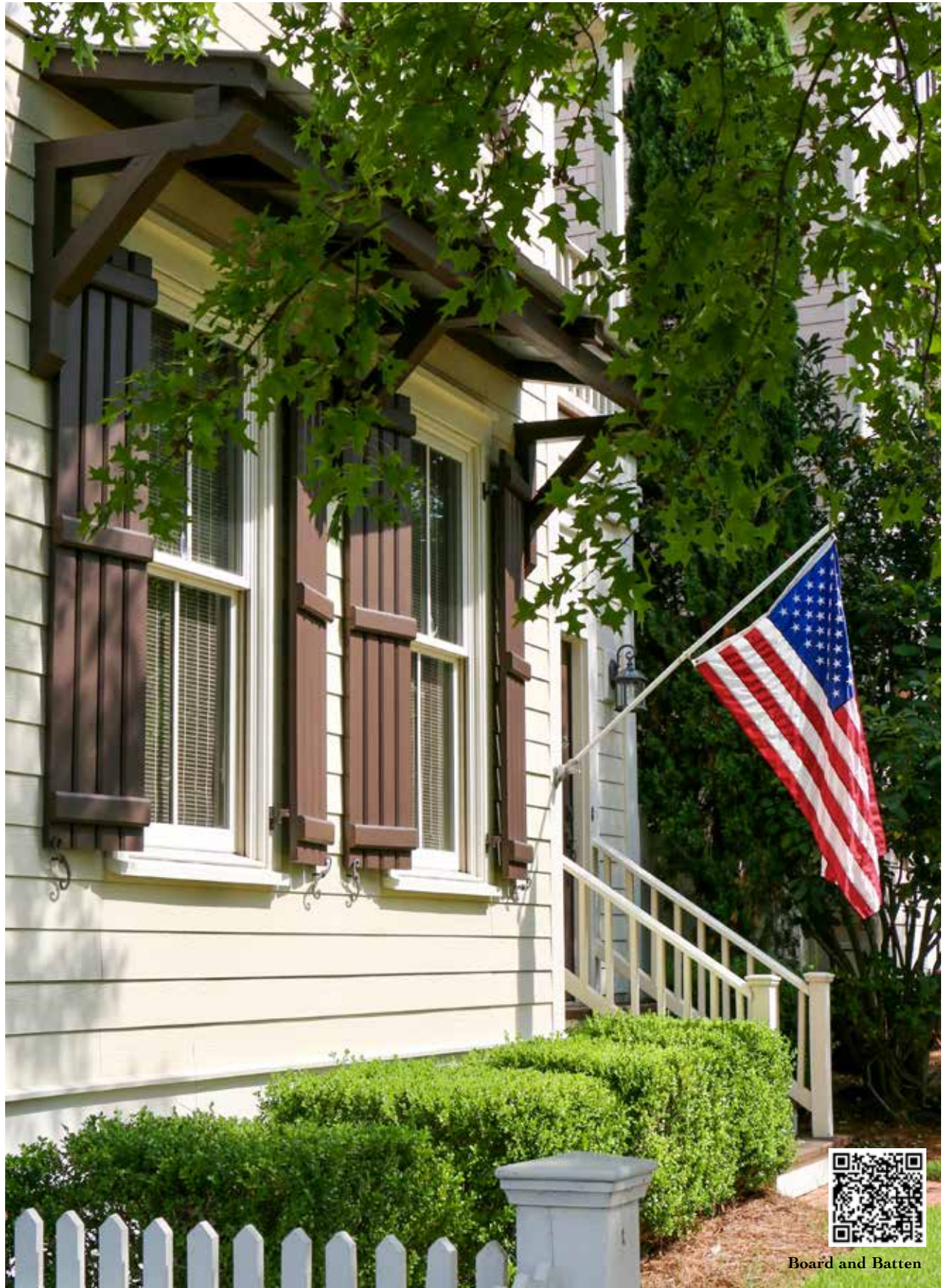
Board and Batten