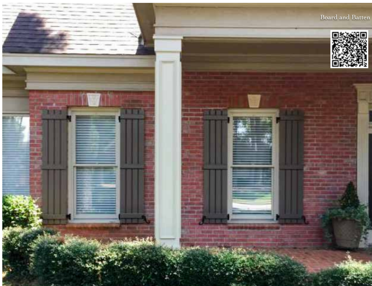
Board and Batten