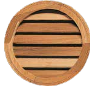
Cedar Ventilator Round with Octagonal Back