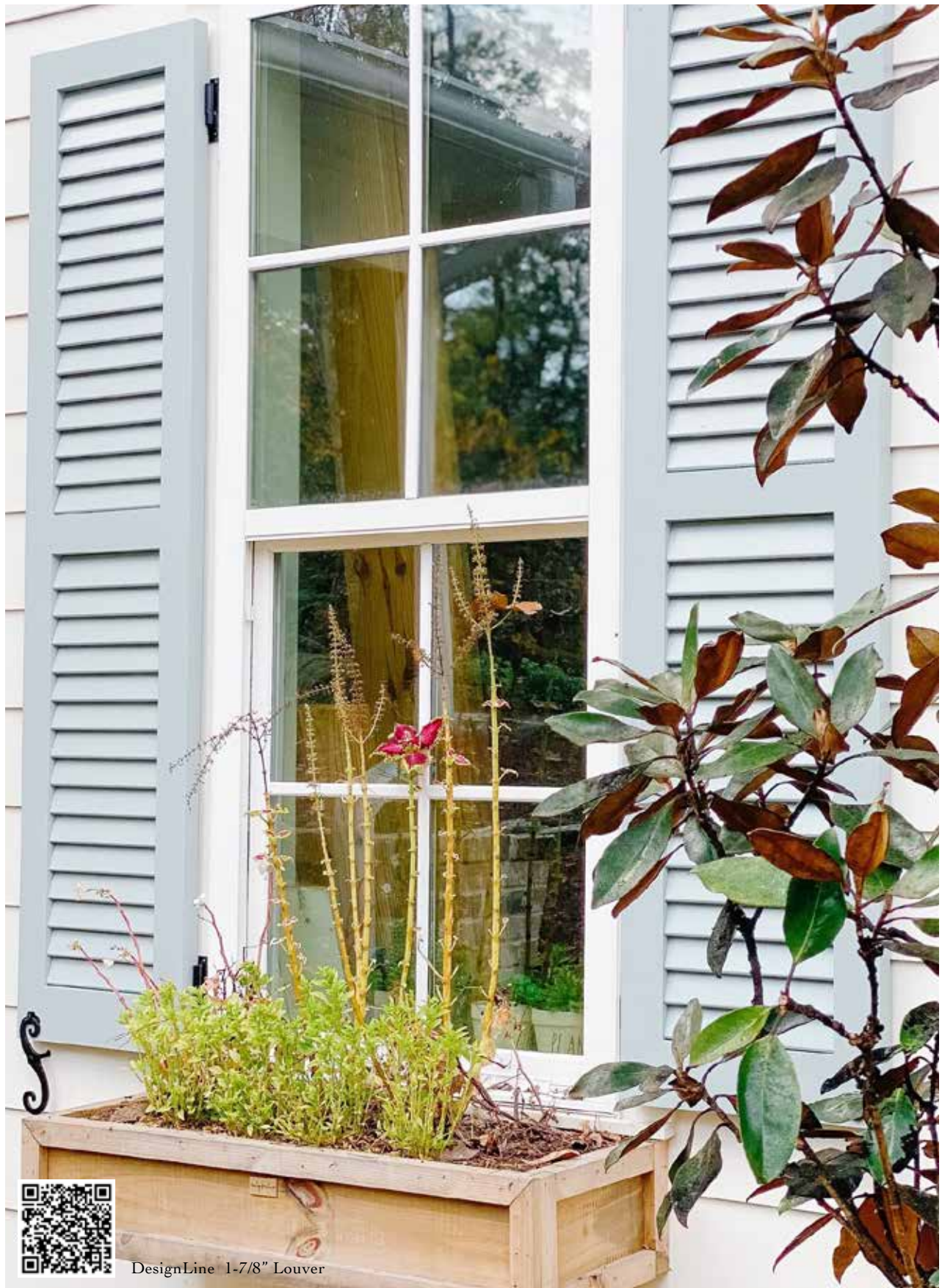
DesignLine 1-7/8" Louver