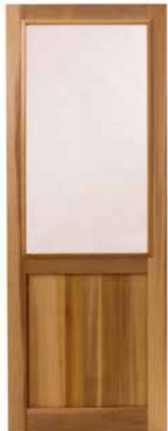
1 Section Screen Over 1 Section Panel Combo