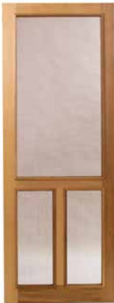
Single Section Screen Over 2 Section Screen