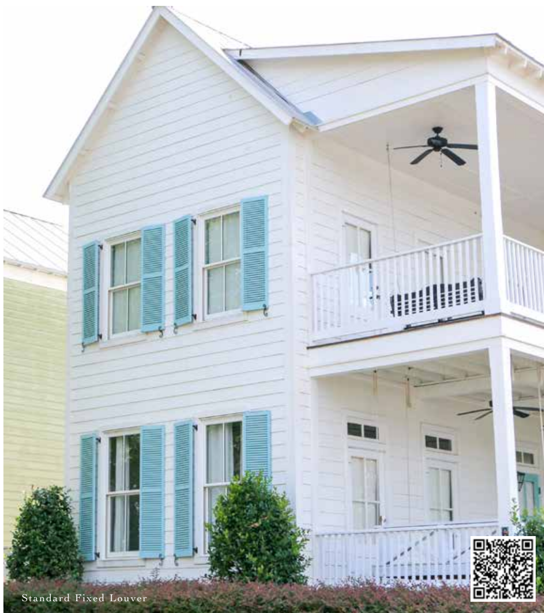
Standard Fixed Louver

_____ Louvered exterior shutters offer a traditional, classic aesthetic that has been a design staple since Ancient Greece.