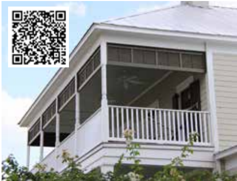
TOP: Heavy Duty Bahama Spandrel BOTTOM: DesignLine Fixed Louver Bahama