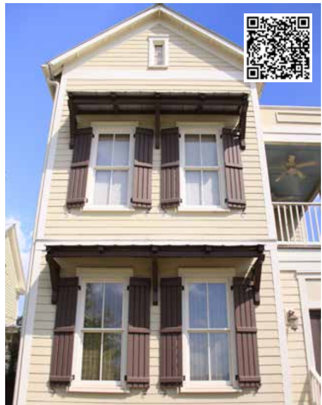
TOP: Composite Board and Batten