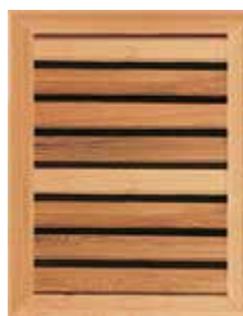
Cedar Ventilator Rectangular