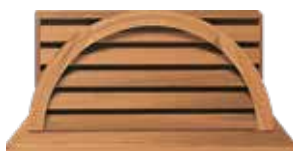
Cedar Ventilator Half Round Dripsill with Rectangular Back