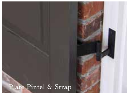
Plate Pintel & Strap