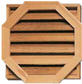
Cedar Ventilator Octagonal with Square Back

Created from clear Western Red Cedar, ventilators are constructed for both style and function. Vents feature a rain stop louver designed to prevent wind driven rain from entering the vented space.