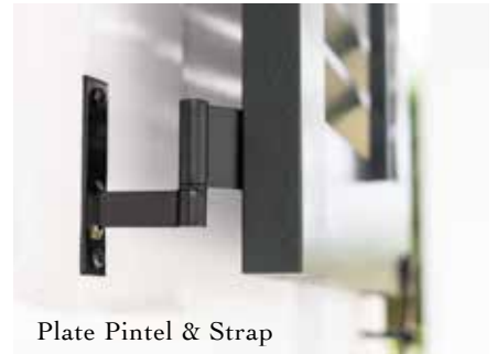
Plate Pintel & Strap