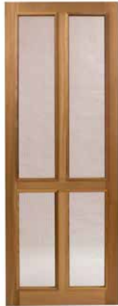
2 Section Screen Over 2 Section Screen