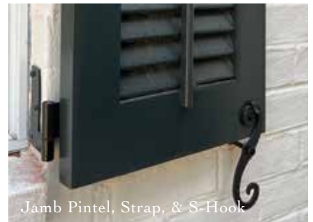
Jamb Pintel, Strap, & S-Hook