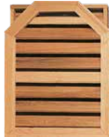
Cedar Ventilator Rectangular Octagonal with Rectangular Back