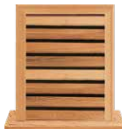
Cedar Ventilator Rectangular Dripsill