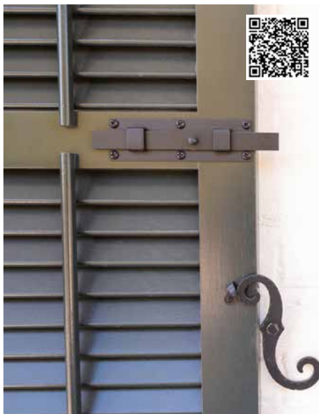
LEFT: DesignLine 2-1/2" Louver with False Control Rod MIDDLE: Heavy Duty Movable Louver with 2-1/2" Louver RIGHT: DesignLine 2-1/2" Louver with False Control Rod