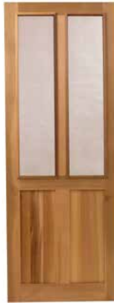
2 Section Screen Over 2 Section Panel Combo