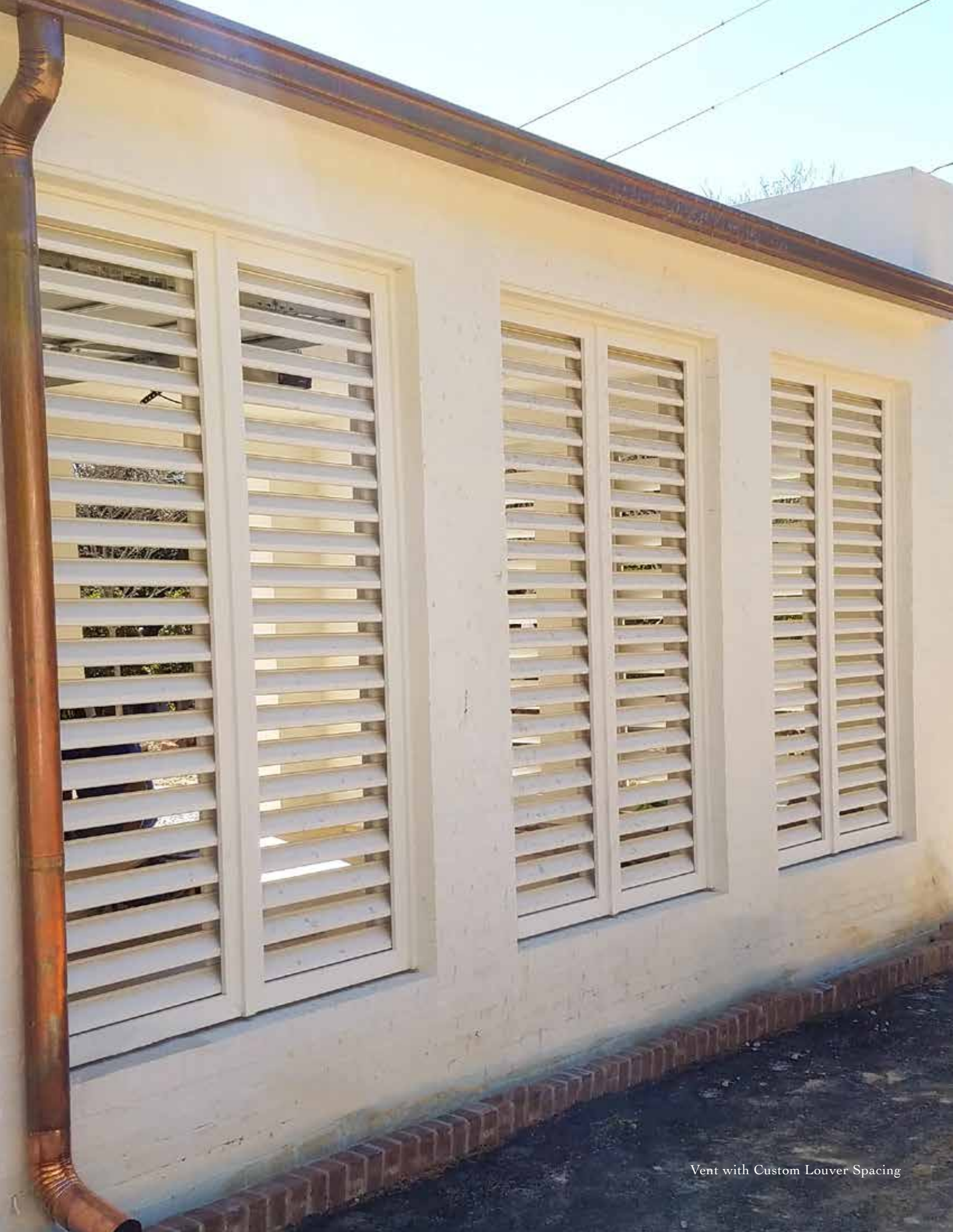
Vent with Custom Louver Spacing