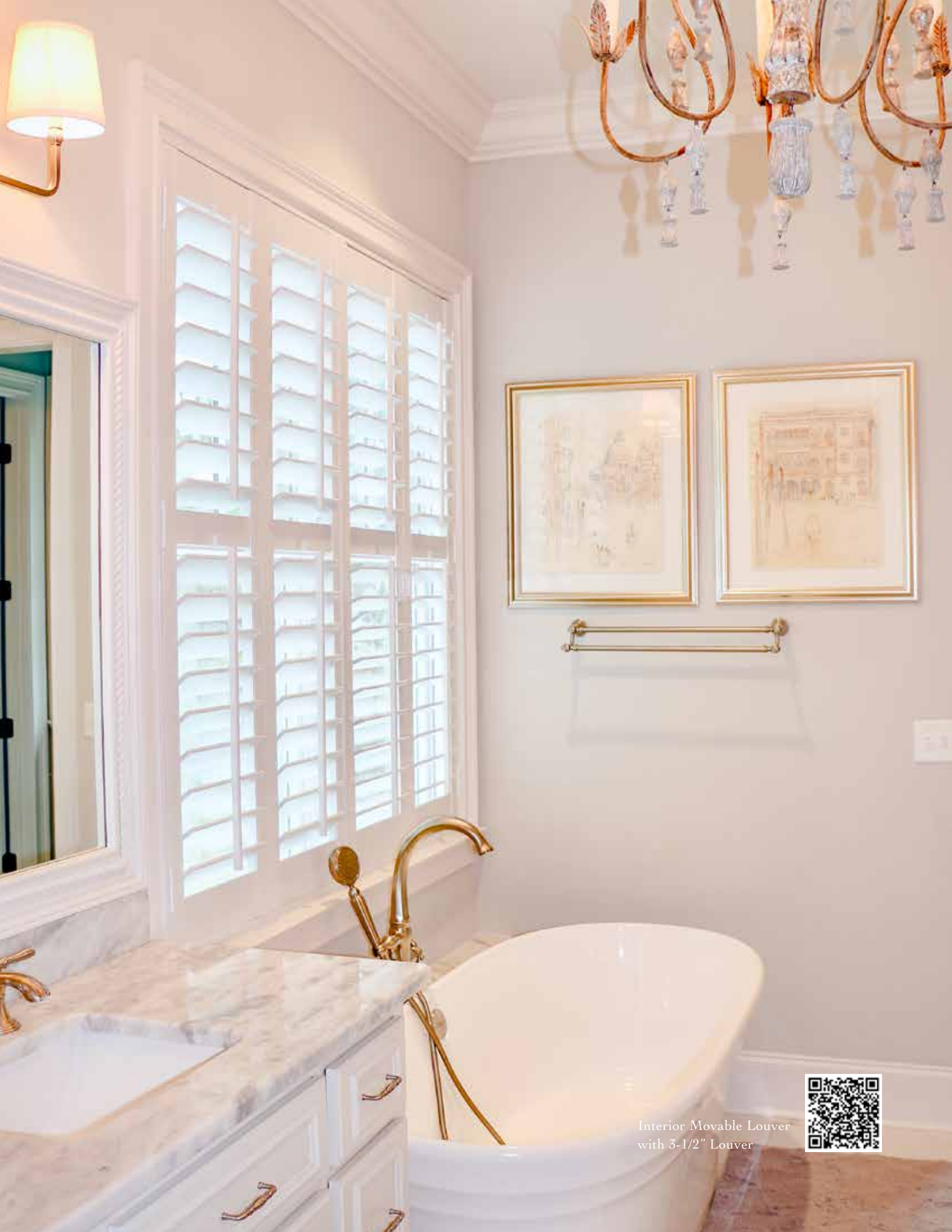
Interior Movable Louver with 3-1/2" Louver