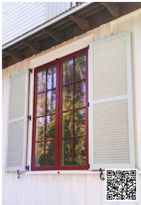
LEFT: Standard Fixed Louver