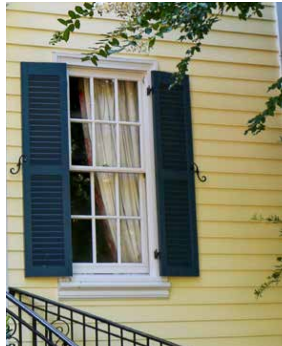
TOP: Standard Fixed Louver