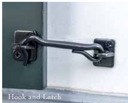
Hook and Latch