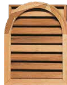
Cedar Ventilator Rectangular Round with Rectangular Back