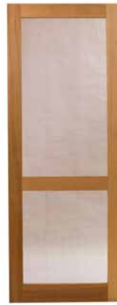
Screen with Center Rail