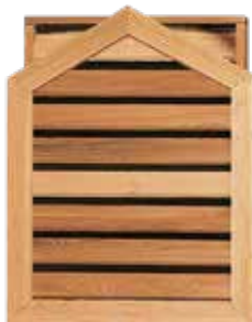
Cedar Ventilator Rectangular Peak with Rectangular Back