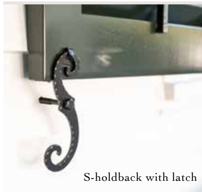
S-holdback with latch