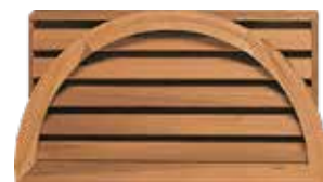
Cedar Ventilator Half Round with Rectangular Back