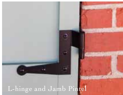
L-hinge and Jamb Pintel