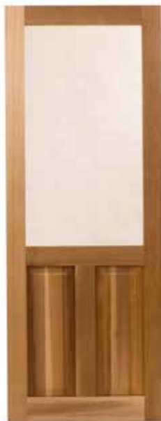
1 Section Screen Over 2 Section Panel Combo