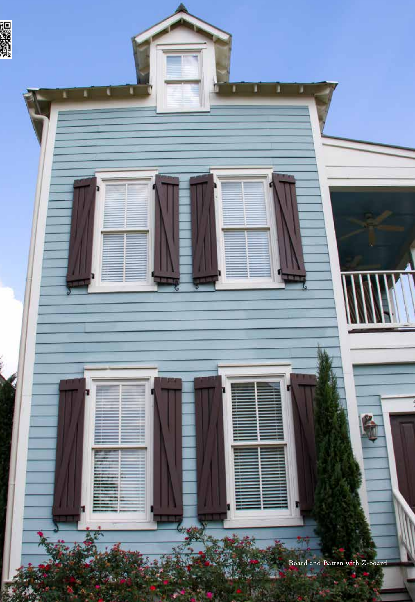
Board and Batten with Z-board